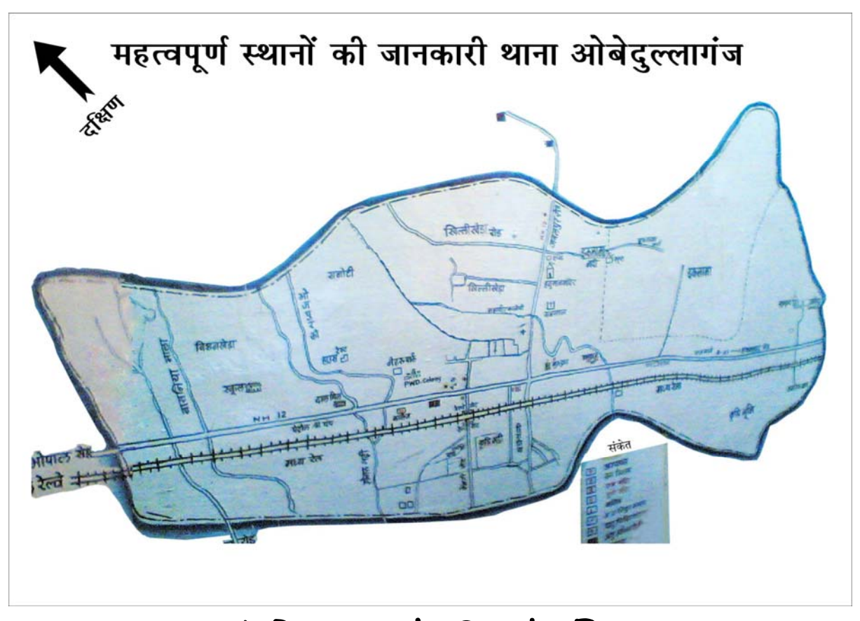
A Research Study For Madhya Pradesh Human Rights Commission

Towards Action And Learning, Bhopal 2007